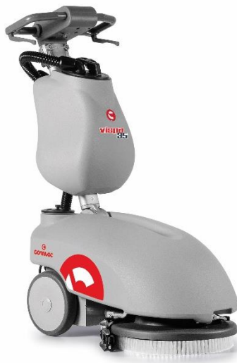
Vispa 35 B Scrubbing version with disc brush