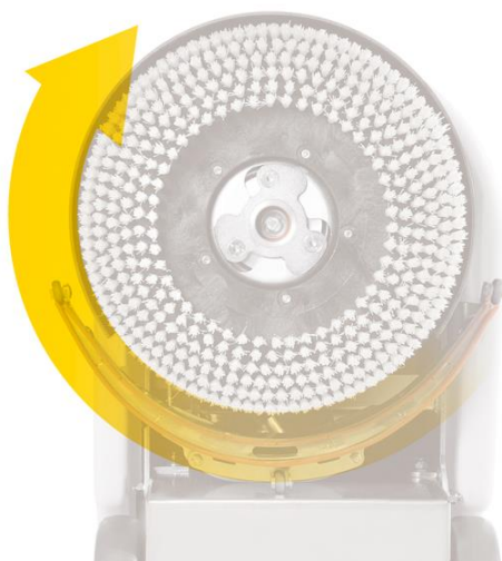
Rotation of the parabolic squeegee