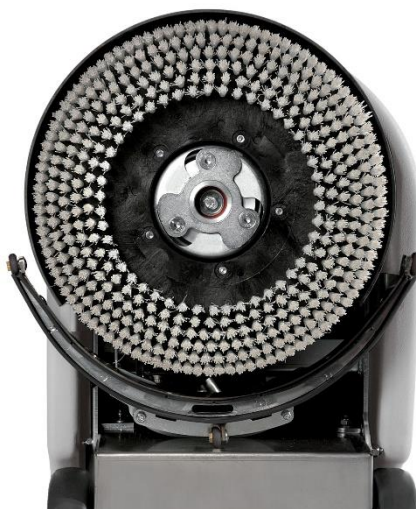
Standard position of the parabolic squeegee