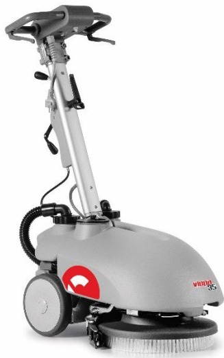
Vispa 35 E Scrubbing version with disc brush

Ideal for cleaning floors of small, very cluttered spaces on surfaces smaller than 1,000 m 2