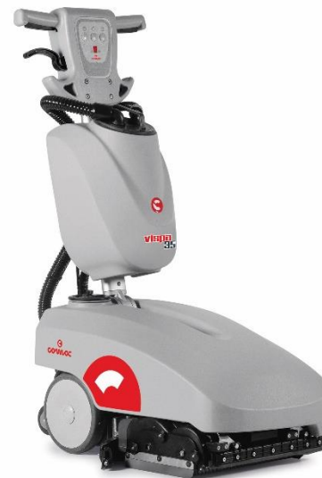
Vispa 35 BS Scrubbing-sweeping version with cylindrical brushes