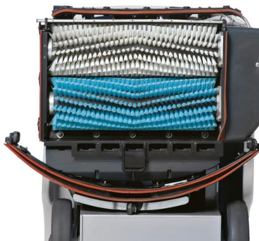
Standard position of the parabolic squeegee